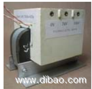
Toroidal power transformer